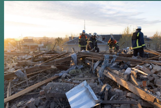
Kharkiv emergency workers: Photographer:

Attacks on power grids also put a strain on the fuel supply in the region. The demand for fuel in Kharkiv has shown significant growth over the past 3 weeks. However, there are no indications of a fuel deficit at this stage and prices currently remain stable. This could change and is important to consider for operations management and Hibernation, Relocation and Evacuation (HRE) planning