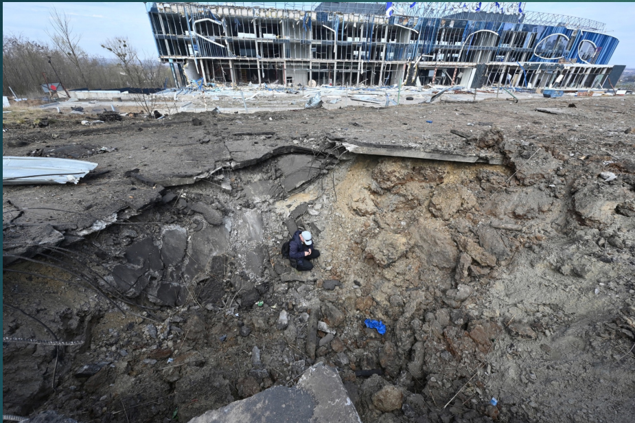
Bomb crater: Photographer: Sergey Bobok/AFP/Getty Images

In parallel, multiple sources report a sharp increase in the activity of Russian ISR (intelligence, surveillance and reconnaissance) drones, that are capable of reaching deep into Ukrainian rear lines and are often used as forward observation for aerial attacks.